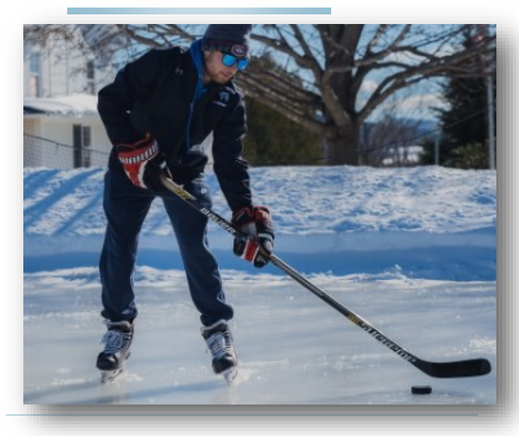
New London's Ice Rink On the Town Green

Be sure to check out all of the ways to embrace winter in NH!