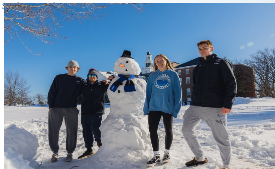
Parent & Family Newsletter A Message from the Dean of Students