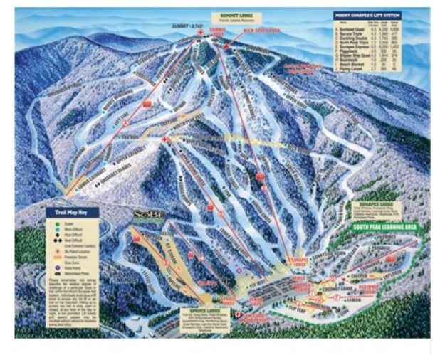
Need a Ride to Mount Sunapee? Click this link: Mount Sunapee Van Registration

to REGISTER on mynew.colby-sawyer.edu Trips